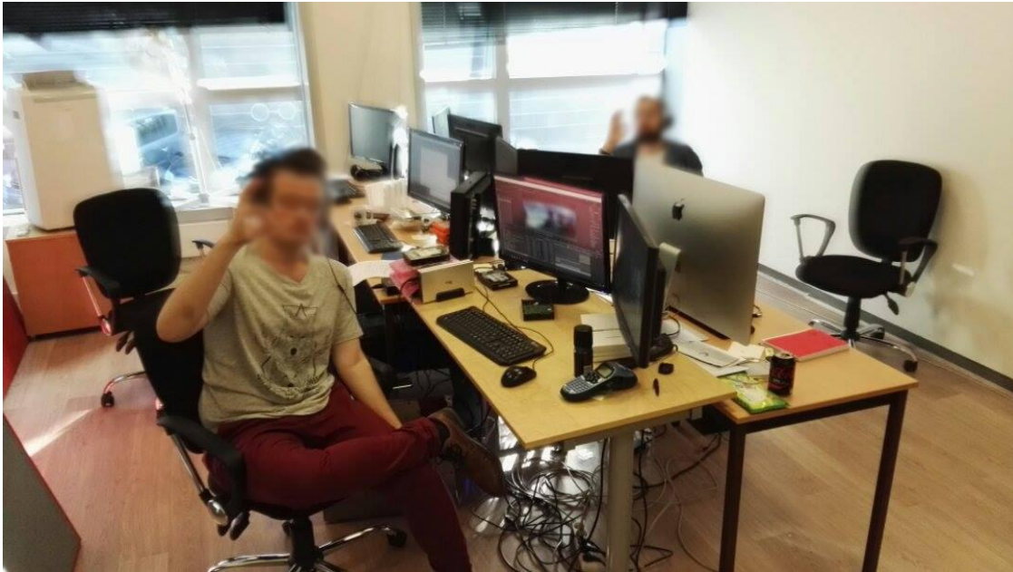
My office and two of my colleagues.